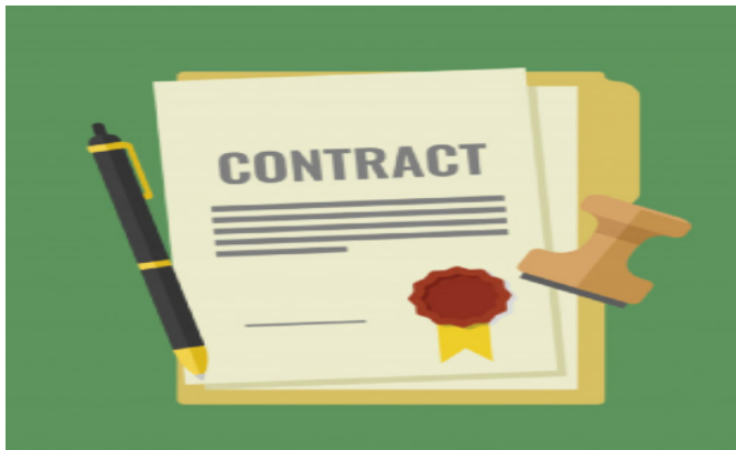
KNOW YOUR CONTRACT, PAGE 5