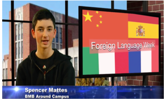
WORLD LANGUAGES CELEBRATED, PAGE 3