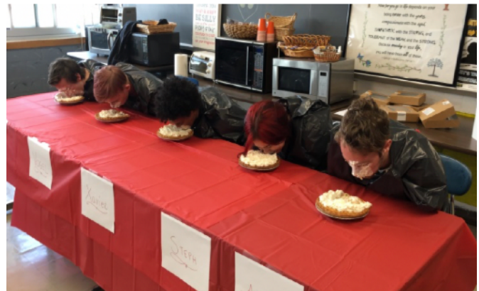
π IN THE FACE. PAGE 7