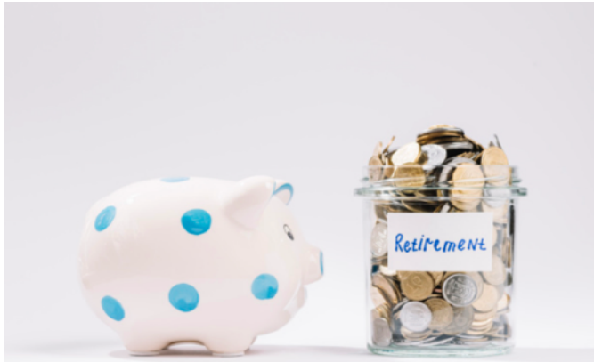
PREPARING FOR RETIREMENT, PAGE 2