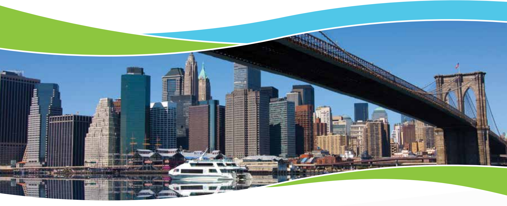
Brooklyn Bridge and Manhattan, New York